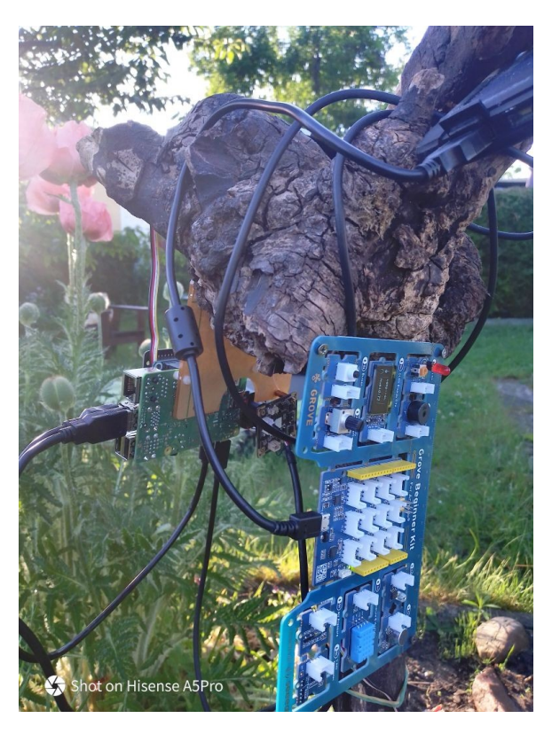
Fig. 2. MW0 in process of providing necessary network & content services for an environmentally referential outdoor on-line course.